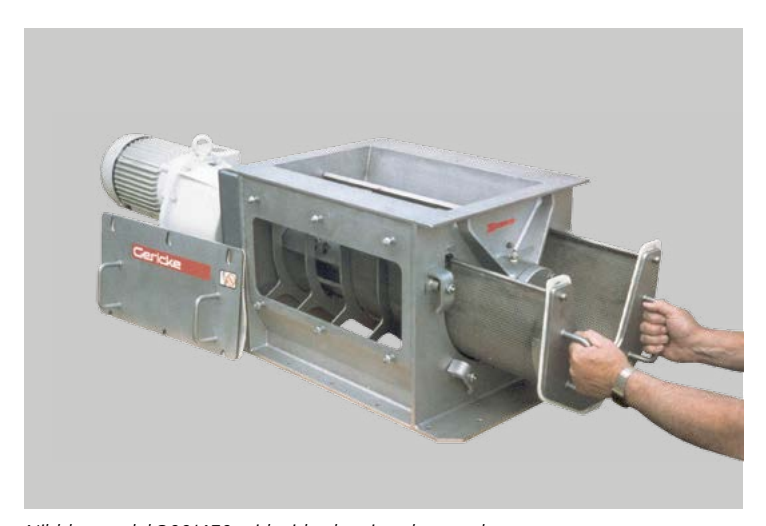
Nibbler model 300/450 with side cleaning door and screen