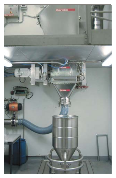
Sack tipping station for breaking up of granules; execution for CIP cleaning

Gericke GCN Cone Nibbler completes the range of products for applications requiring a very fine particle size, or if increased bulk density is required. Screen sizes range from 2000 to 150 \mu . Please request the appropriate documentation for this equipment.