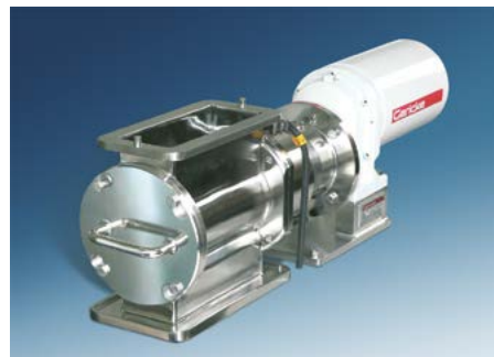
Pharmaceutical execution for exacting requirements, special requirements available

Picture left: Nibbler installed after filter press for breaking up filter cake