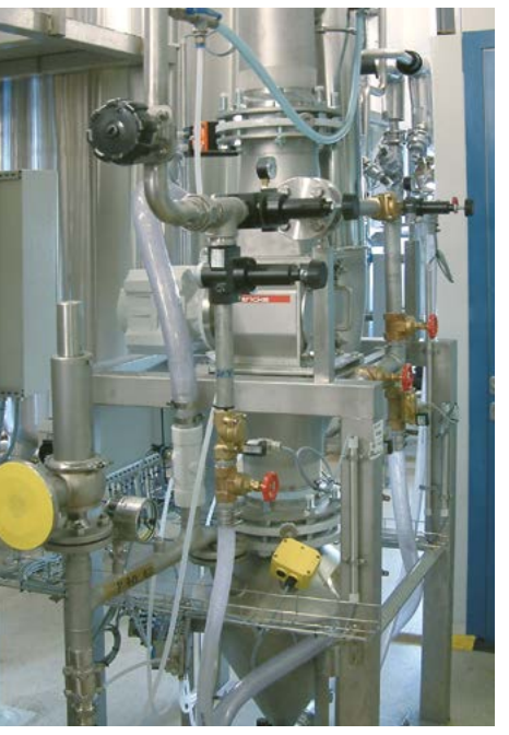
NBS 200/200 installed before pneumatic dense phase conveying