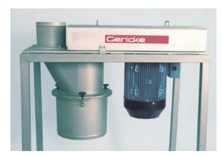
Cone Nibbler GCN

Gericke GCN Cone Nibbler completes the range of products for applications requiring a very fine particle size, or if increased bulk density is required. Screen sizes range from 2000 to 150 \mu . Please request the appropriate documentation for this equipment.